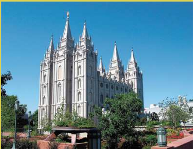
Joseph Smith, Founder of the LDS Church. Below is the LDS Temple in Salt Lake City, Utah.

In reality, the Mormon Church, currently headquartered in Salt Lake City, Utah, is nothing less than an anti-Christian, blasphemous arm of World Jewry. It is a Judaic cult. As such, the Jewish rabbis cooperate fully with the Salt Lake City religious elite in helping the Mormons achieve their earthly goals. Indeed, the real goal of the Mormon church is to exalt physical Israel as God's Chosen People and to establish a Hebrew-led global empire. At the helm of that empire, the Mormons believe, will be a Hebrew King.