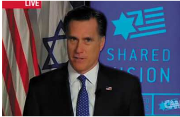
Mormonism is a Trojan Horse of global Zionism, and Mitt Romney is the perfect tool of Zionist interests.

In reality, the Mormon Church, currently headquartered in Salt Lake City, Utah, is nothing less than an anti-Christian, blasphemous arm of World Jewry. It is a Judaic cult. As such, the Jewish rabbis cooperate fully with the Salt Lake City religious elite in helping the Mormons achieve their earthly goals. Indeed, the real goal of the Mormon church is to exalt physical Israel as God's Chosen People and to establish a Hebrew-led global empire. At the helm of that empire, the Mormons believe, will be a Hebrew King.